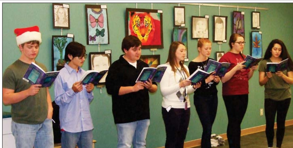
Above: Singers from Palmer Ridge High School entertained with traditional carols in the library on Dec. 13. See page 22 for the monthly library events article.