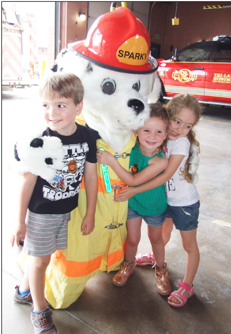
Above: Locals enjoy a day at the firehouse: Sparky welcomed pint-sized hugs at the Tri-Lakes Monument Fire Protection District's open house Saturday, Sept. 9. Area kids had the opportunity to shower affection on their favorite firehouse dog while sipping lemonade, munching hot dogs and snacks, and exploring the district's fire trucks and equipment at Station 1 located at 18650 Highway 105. Parents learned about topics such as "Top Tips for a Safe Home," "Poisoning Prevention Tips," and "Carbon Monoxide Poisoning Prevention Tips." Firefighters provided courtesy car seat safety checks for their littlest visitors as well. The district also provided information regarding its mill levy proposal that will be included on the 2017 November ballot. Residents who wish to learn more about the proposal may request a "Frequently Asked Questions and Answers" packet from the district by calling 484-0911 or visiting their website at www.tlmfire.org . Caption and photo by Jennifer Kaylor. For additional fire district coverage see page 12-13.