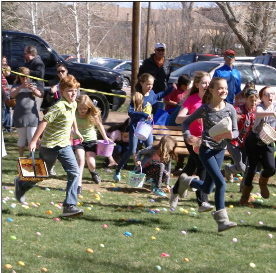
Above: On Saturday, April 15, the Ascent Church hosted its annual community Easter egg hunt at the Palmer Lake Town Hall. On the sunny spring day, hundreds of children had fun looking for eggs or playing in the bouncy house.

Print Run: 17,950 Mail Delivery: 17,153 Stacks: 797