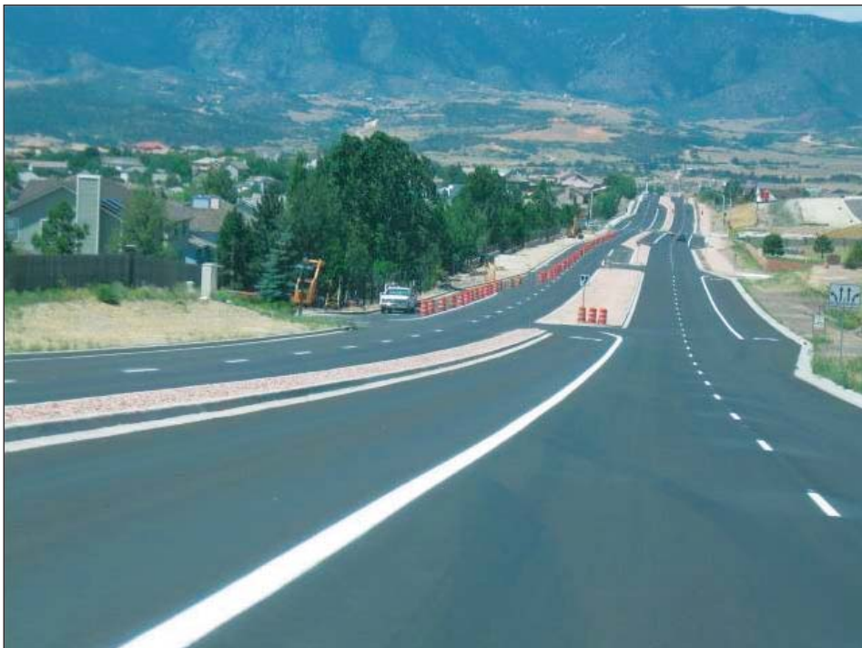
Above: This recent view of Baptist Road looking west past Desiree and Kingswood Drives shows how one of BRRTA's projects starting in 2009 expanded the road from two to four lanes from Tari Drive to Jackson Creek Parkway.