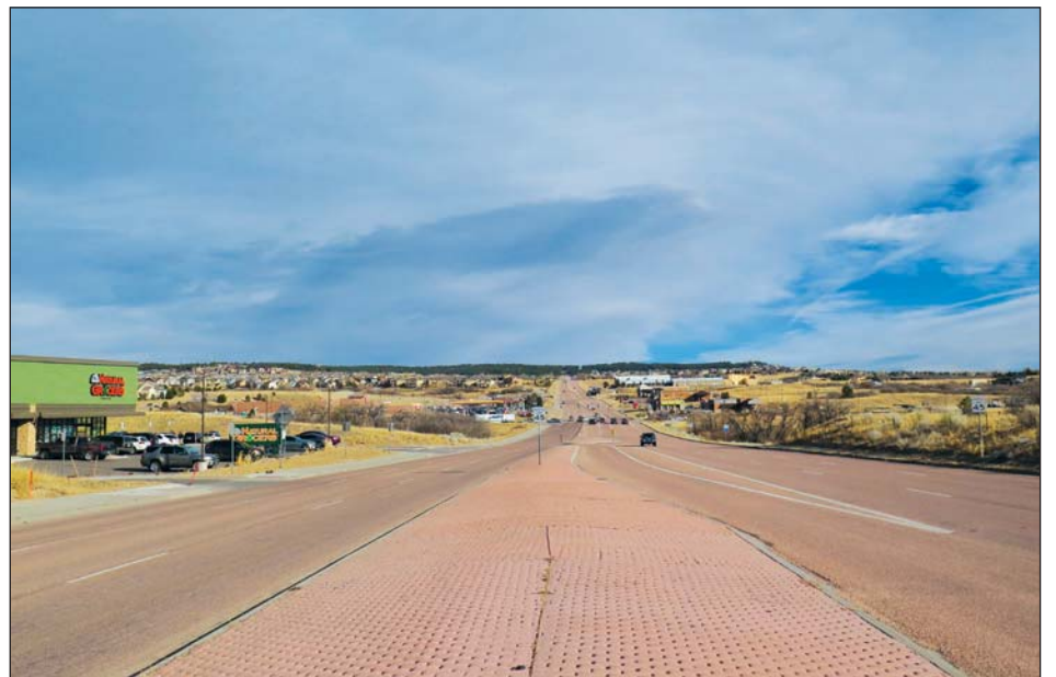
Above: This recent view of Baptist Road was taken from near the same spot as the photo on the left and shows how the road looks now. Tari Drive is in the trees near the top of the distant hill.