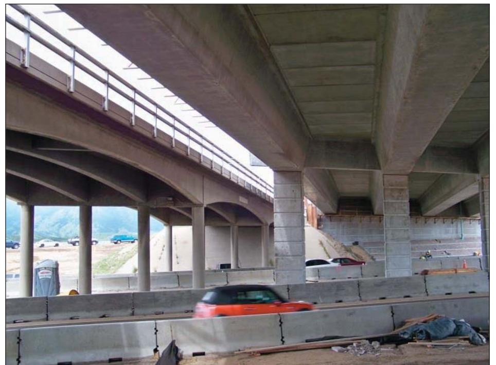
Project highlights of the I-25/Baptist Road Exchange expansion in 2008-09 included widening Baptist Road close to the interchange to four lanes and adding turn lanes, widening the road over I-25 to eight lanes, adding new traffic signals and modifying the ramps, and installing new water and sewer lines. Above: The old I-25 bridge on the left and the new one on the right. Below: Removal of the old bridge.