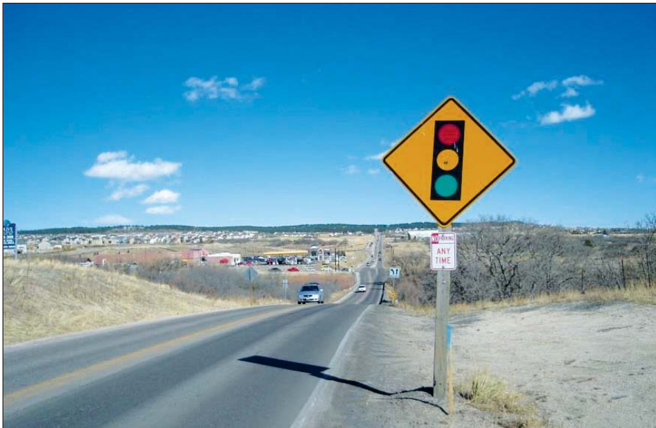
Above: This pre-2009 view of Baptist Road looks east from I-25 toward Jackson Creek Parkway and Family of Christ Lutheran Church and shows how the road looked before BRRTA widened the road and made a variety of other improvements.