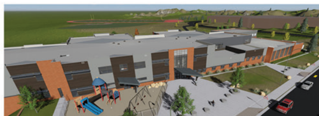
Proposed architectural rendering of the new elementary school on the SW corner of the Bear Creek site.

Adding physical security features (cameras, secure entry vestibules, etc) and more security personnel and counselors keeps our kids safe on many levels.