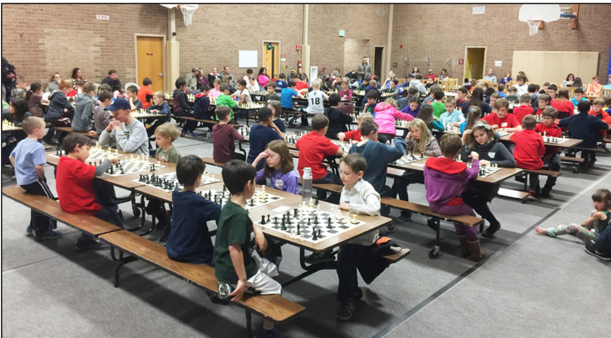
Above: The 12th Annual Lewis-Palmer School District 38 Chess Tournament was held at Lewis-Palmer Elementary School on Feb. 10. This year, there were a record 121 chess players and 43 trophy winners in the tournament, ranging from first grade through high school. For information, 488-9887 or huskerco@gmail.com.

ported by superintendents statewide does not result in greater funding but addresses the use of funds that become available.