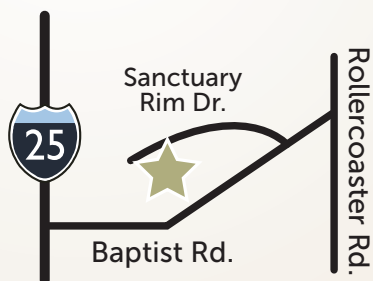
Located along the western edge of the Black Forest just off Baptist Rd. and Sanctuary Rim Dr.