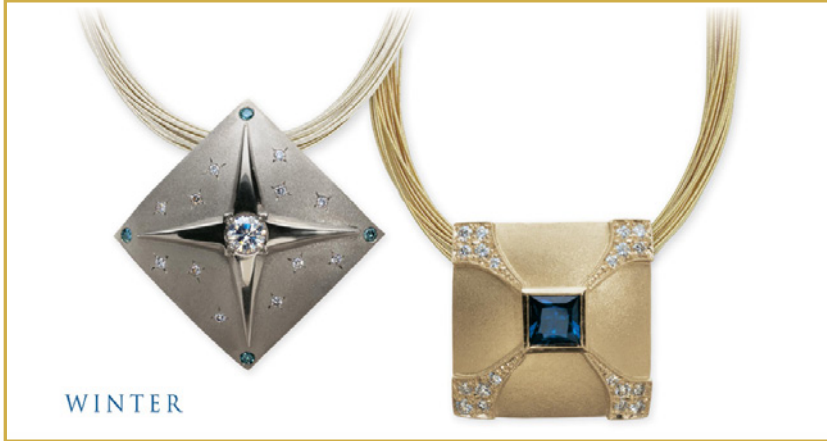
A Reversible Pendant in 18Kt. Gold, Sapphires and Diamonds.

Jewelry and Design Excellence Since 1980