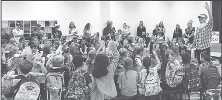
HomeSchool Enrichment Academy’s First School Day