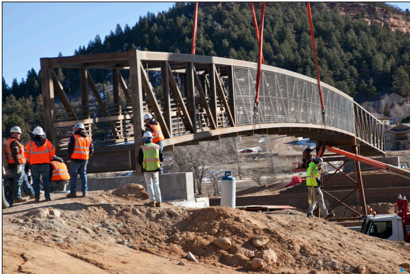
Above: On January 7, SEMA Construction Inc. installed the two sections of the bridge manufactured by Big R Bridge Manufacturing. The funding for the bridge came from Awake Palmer Lake and its related events, a Great Outdoors Colorado (GOCO) grant, and matching funds from the Town of Palmer Lake. See additional photos on pages 24-25. To make a part of the bridge a permanent memorial for your business, your family, or your loved ones' memory, see the ad on page 2.