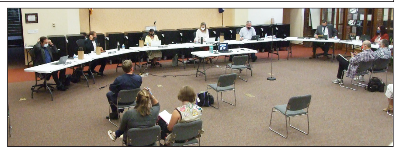
Above: The Board of Education now meets in person while enforcing social distancing among themselves and spectators.

modify current fees to reflect modified calendars and to request any necessary waivers from the Colorado State Board of Education or the Colorado Department of Education as necessary.