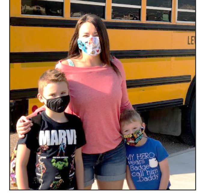
Above: A family arrives at Bear Creek Elementary on the first day of school.

or safety if the district controls the workplace conditions giving rise to the threat.