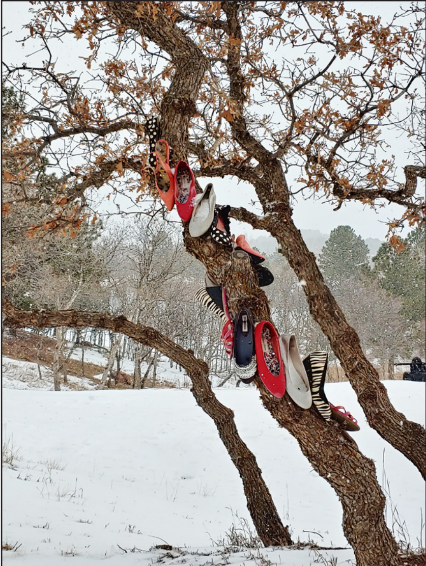
Above: "Fun Footwear Yard Art" - In December, while taking my daily walk during snow flurries, I came upon this creative, playful display of shoes among some roadside Gambel oaks.