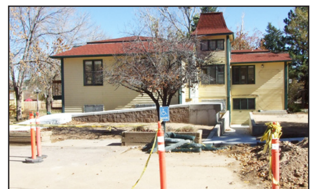
Above: Progress continues on construction of new ADA-compliant ramp to the Palmer Lake Library and the museum on the lower level.

Harriet Halbig may be reached at harriethalbig@ocn.me .