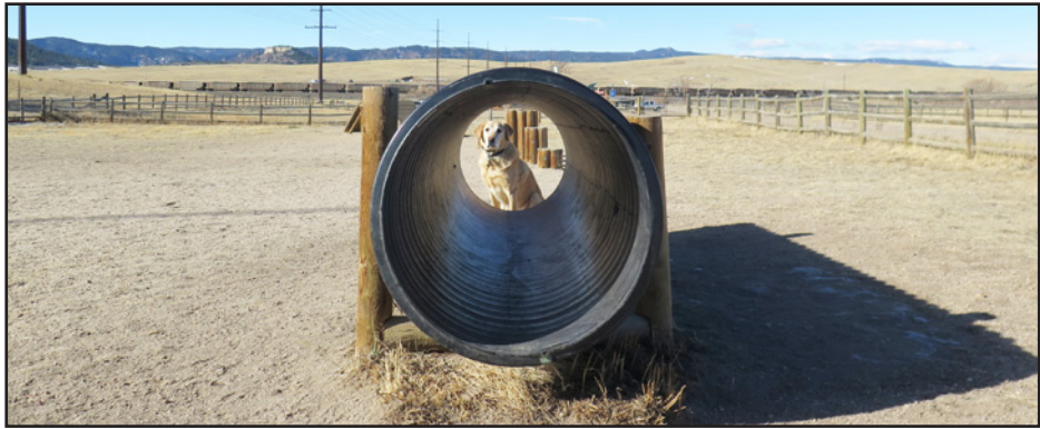
Above: Devon's Dog Park was established by Devon Theune in 2008 to earn her Girl Scout Gold Award, in cooperation with the Douglas County Division of Open Space. She said, "I hope to be the kind of person my dog thinks I am." The 15-acre fenced park makes a 2/3-mile loop and shares a parking lot with the Greenland Open Space Trailhead at 1532 Noe Road, Larkspur. Containers at the gates provide a convenient place for people to clean up after their dogs, which is vital for keeping E. coli out of the watershed. No water, shade, or separate area for small dogs is provided, but there is a separate dog agility playground with a tunnel, ramps, and other obstacles for well-trained dogs to maneuver.