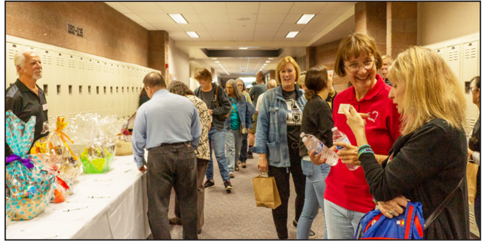
Above: This year's Empty Bowls event was held on Oct. 12 at Lewis-Palmer High School. The Kiwanis Club of Monument Hill sponsors this event, which provides handmade bowls from local artisans along with food from local restaurants. This year's event raised over $19,000 for Tri-Lakes Cares (TLC), a local nonprofit that supports those in need in the community. TLC hosted a silent auction with over 130 items offered by local vendors, artists, restaurants, and other donors. Volunteers helped solicit items, prepared baskets, created and sold floral arrangements, set up and tore down the day of the event, monitored the auction tables and answered questions, and handled the cashing. It takes many hands to make an event successful, and TLC is grateful for all the support.