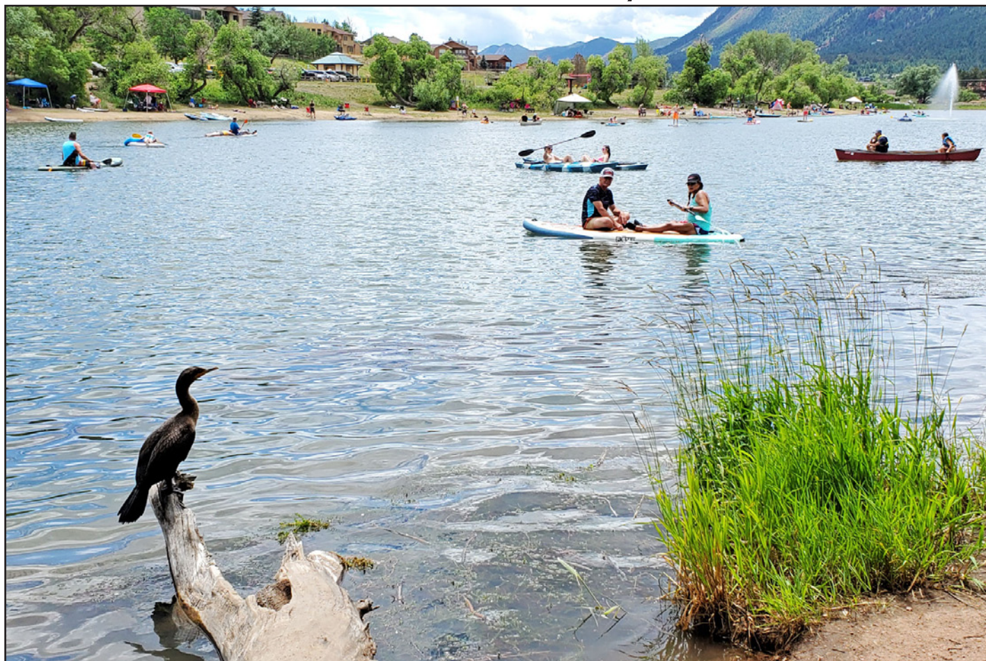
Above: A double-crested cormorant and paddle boarders enjoyed a sunny July 3 at Palmer Lake.

Monument Academy School Board, July 14, 22, and 25