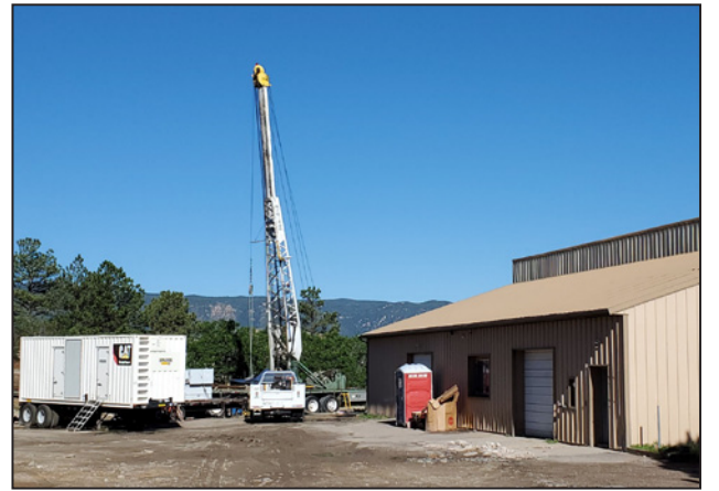
Above: On July 7, the Donala Water and Sanitation District well drilling project continued at the Gleneagle Maintenance Facility on Pauma Valley Drive. The drilling was completed one week later.