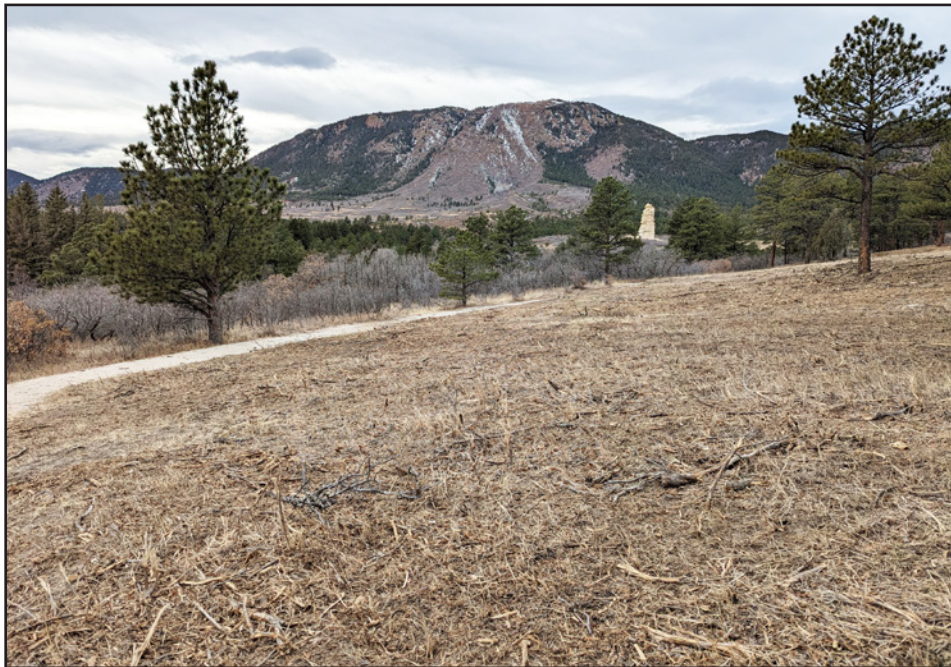
Above: Continuing efforts to mitigate wildfire risks are evident along trails in the Monument Preserve. Substantial groves of Gambel oak and other vegetation have been removed along the trail just south of Mount Herman Road leading to Monument Rock as seen Dec. 27.