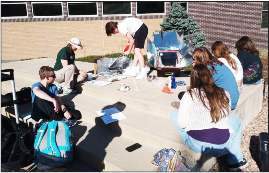
Above: The emergency preparedness club at Palmer Ridge High School tested solar oven cooking as an alternative energy source to use when there is no power, either after a blizzard or when going camping. In this demonstration, the club baked banana muffins in a commercial solar oven (successfully) and hard-cooked eggs in a solar oven made out of a reflective car window shade (which would have been successful with another hour of cooking). Lessons learned: You can't rush it when doing solar cooking, and it only works when the sun is shining and it's not too windy. Coming up this year, the club members will do hands-on learning about first aid, car emergencies, wildfires, and lots more, with the support of sponsor Eric Wall. Caption by Lisa Hatfield.