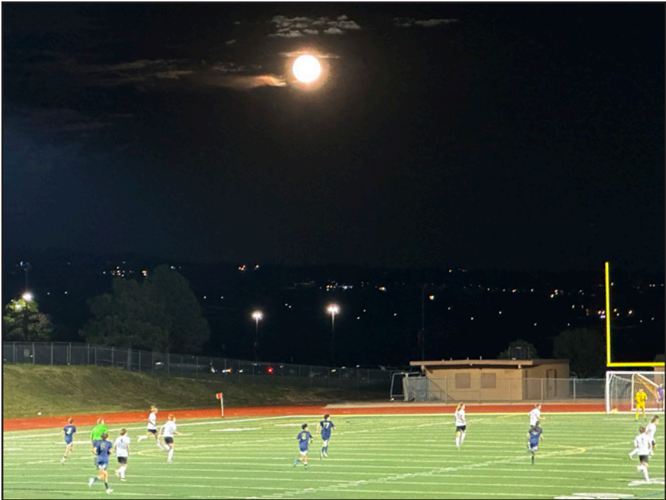
Above: A super blue moon rose above a high school soccer match at Don Breese Stadium on Aug. 30. A blue moon isn't actually blue. It just refers to the fact that it was the second full moon in the same month. The phenomenon is so rare, it's the source of the phrase "once in a blue moon." The next super blue moon won't rise until January 2037. The celestial event wasn't a lucky one for Palmer Ridge High School. The Bears were shut out by Coronado 2-0.

By Janet Sellers Although we strive for accuracy in these listings, dates or times are often changed after publication. Please double-check the time and place of any event you wish to attend by calling the information number for that event. Please notify us if your event listing needs to be updated.