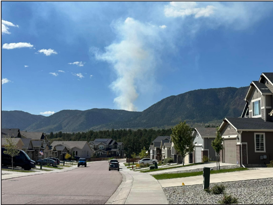
Above: Large plumes of smoke were visible in Monument from the prescribed burns on Sept. 25-27. The U.S. Forest Service and the El Paso County Wild-land Fire Group carried out the three-day controlled burns in Ensign Gulch near Rampart Range Road, and Forest Service Road 314. The burn covered almost 400 acres and is part of an ongoing effort to reduce forest fire fuel in the area. Caption by Natalie Barszcz.