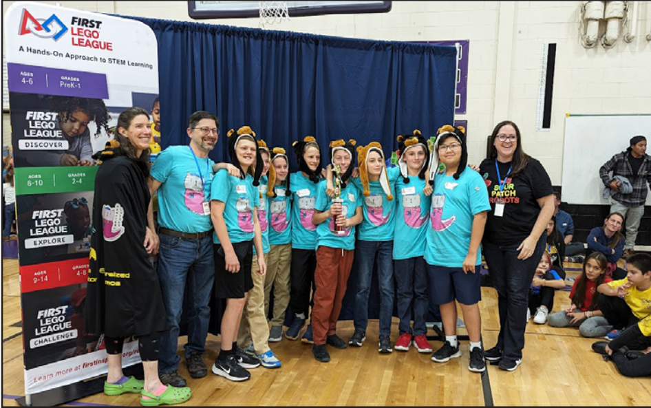
Above: School District D38's Bearbotics team, Hampterlotols, (in photo) won the Champion Award at the FIRST (For Inspiration and Recognition of Science and Technology) Lego League Challenge on Nov. 11 in Fountain. The robotics team of Lewis-Palmer Middle School (LPMS) students earned a Golden Ticket to the state championship in Denver on Dec. 9.