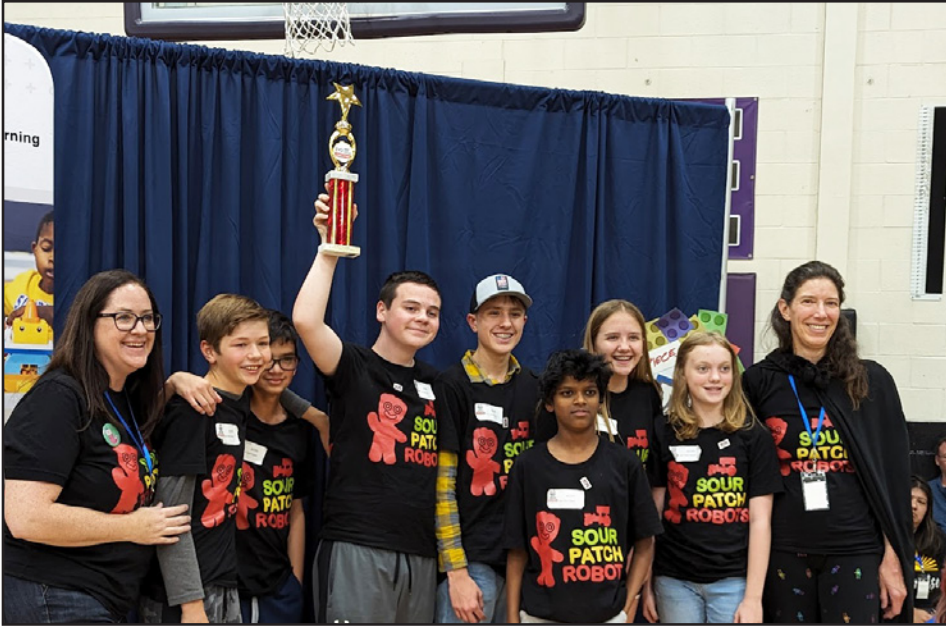
Above: The LPMS Sour Patch Robots won first place in the Robot Design category, also earning a Golden Ticket to the state championship.