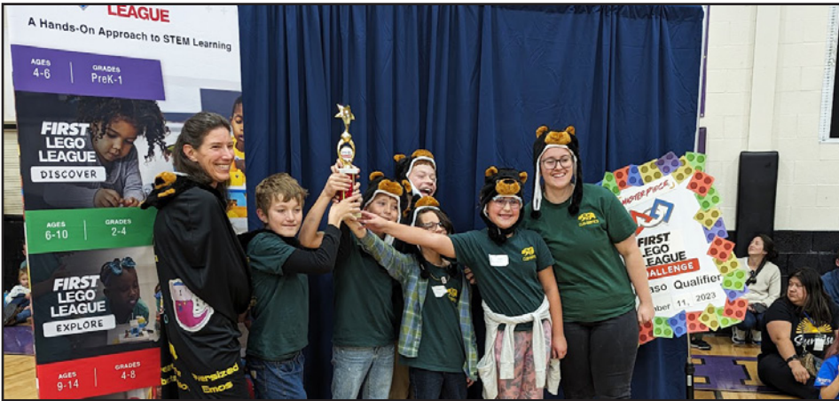
Above: The Oversized Elmos team made up of Bear Creek Elementary School (BCES) students came in second place in robot performance.