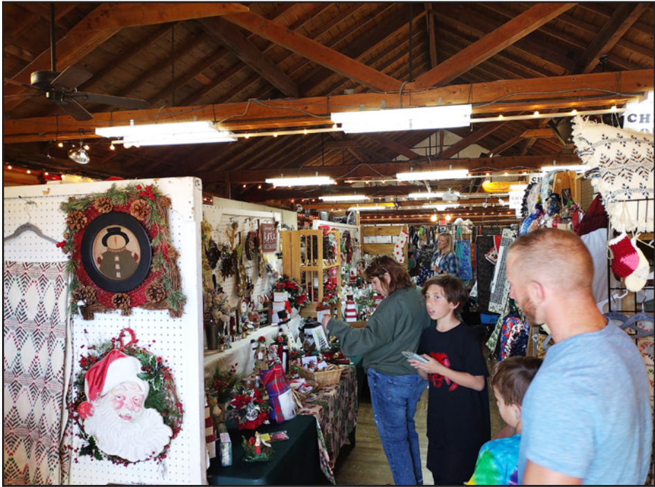
Above: The 59th Annual Black Forest Arts & Crafts Guild (BFACG) held its Fall Show at the Black Forest Community Center on Nov. 1-5. The BFACG is the longest, continuously running Craft Guild West of the Mississippi River. The Spring and Fall Craft Shows raise money for its scholarship fund. The BFACG annually awards a graduating senior attending high school within the Black Forest area. For more information, go to www.bfacg.org/scholarships.