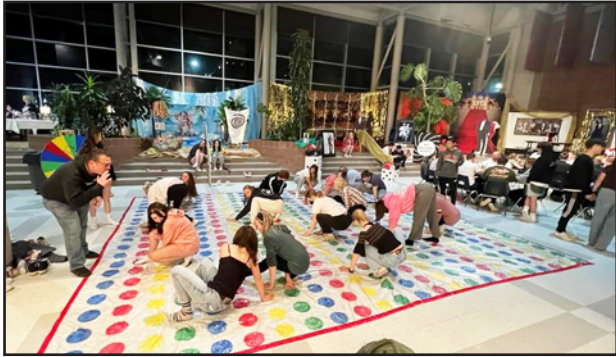
LPHS After Prom

Mod Pizza, City Rock, Lolley's, Freedom Car Wash, Black Forest Deli, Legends Mini Golf & Batting, Pies & Grinders, In-N-Out, Bad Daddy's Burgers, Texas Roadhouse, Costa Vida, Burger King, Buffalo Wild Wings, Chipotle, World Arena, Whataburger, Vibes, The Edge Zipline, Snarf's, Red Robin, Qdoba, PF Chang, Nothing Bundt Cakes, IHOP, I Fly, Freedom Car Wash, Freddy's, Elitch, Denver Zoo, Crumble Cookie, Canes, Fuzzy's, Hamula Orthodontics, Taco Bell, Torchy's, and Wendy's.