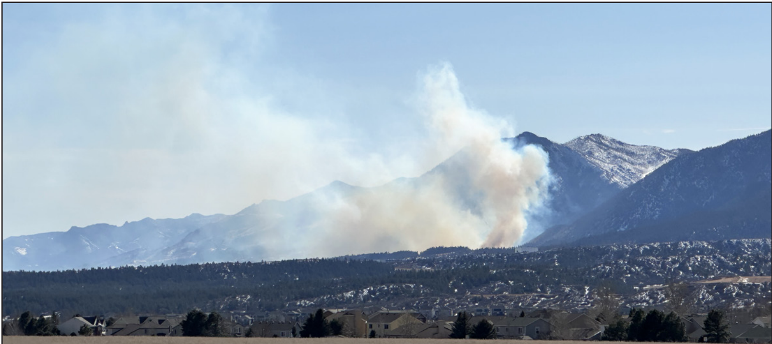
Above: Large plumes of smoke were visible from the Tri-Lakes area on the afternoon of Feb. 25. The smoke was generated by a brush fire on steep terrain north west of West Monument Creek Road on the south side of the Air Force Academy. The fire began around 1 p.m. Wind was gusting from the west at 30-40 miles per hour throughout the day. By evening, the fire had grown to about 150 acres. Due to the fire, the base was closed to the public, pre-evacuation notices were issued for Douglass and Pine Valley housing, Douglass Valley Elementary School was closed, and Air Academy High School students switched to remote learning. A Red Flag Warning had been in effect when the fire began with higher-than-normal temperatures and wind gusts in the forecast. As of Tuesday morning, Feb. 27, at 4:30 a.m., the fire was 168 acres and 50% contained. Caption by Natalie Barszcz.