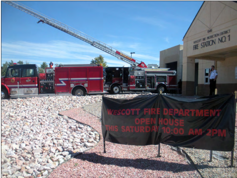
Above: (Left) Some of the equipment on display at the Safety Fair, June 2.