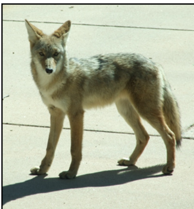
Above: Coyote in a driveway in South Woodmoor, September 2013.