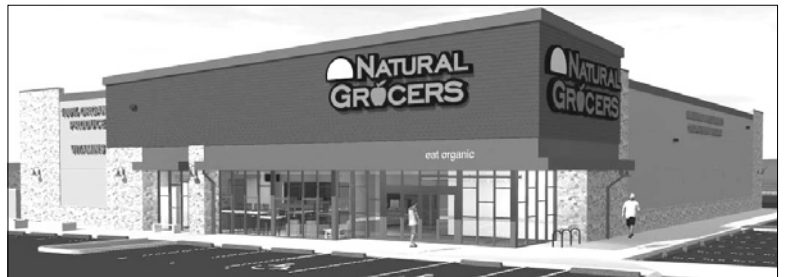
Below: Proposed new Natural Grocers store.

trolled by El Paso County, which has the authority to allow or deny access to particular parcels. The current access is a three-quarter right-in, right-out-only stub intersection.