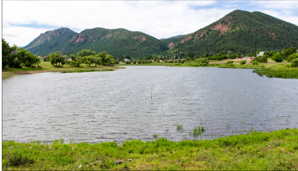
Above: The Lake is a lake. Water returns to Palmer Lake as the town gets permission to divert water from the reservoir and the weather cooperates with plenty of rain.

Print Run: 16,820 Mail Delivery: 16,159 Stacks: 661