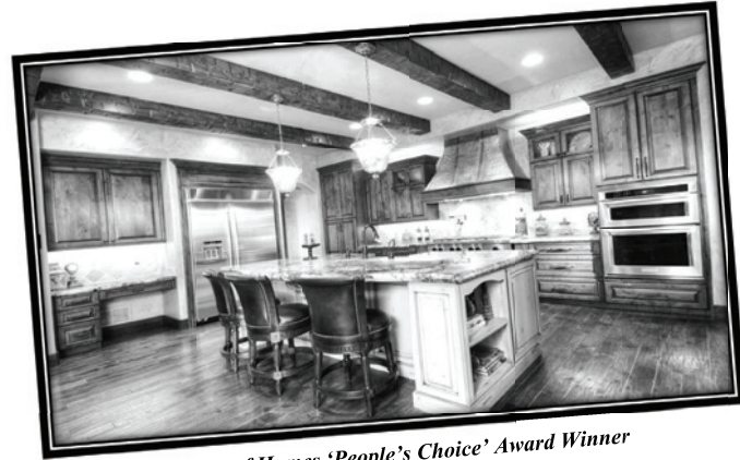
2015 Parade of Homes 'People's Choice' Award Winner

The Top Kitchen Designers in Southern Colorado Right Here in Monument!