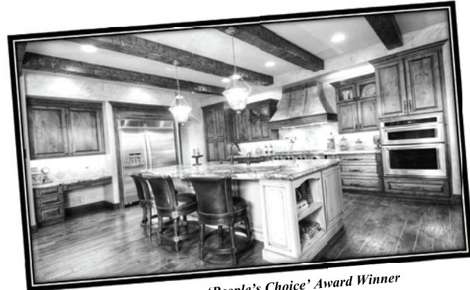
2015 Parade of Homes 'People's Choice' Award Winner

The Top Kitchen Designers in Southern Colorado Right Here in Monument!