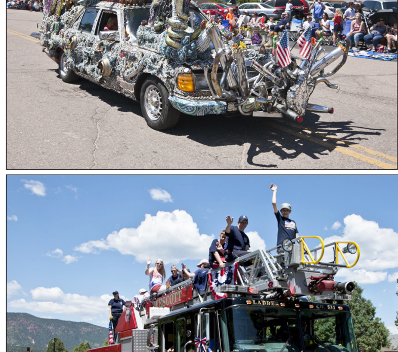
Wescott Fire Protection District