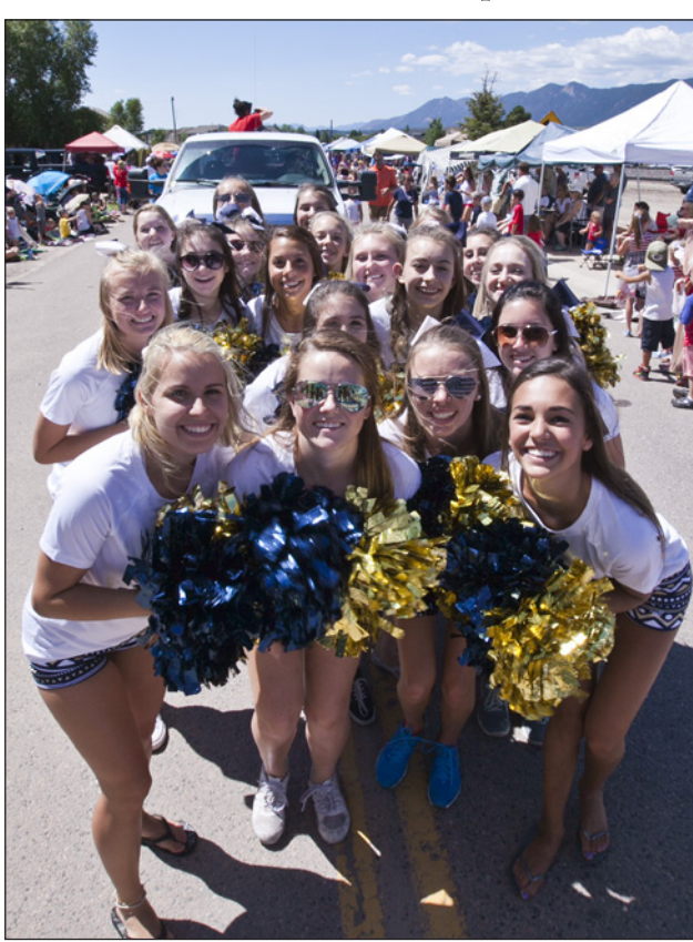
Palmer Ridge High School cheerleaders— Colorado High School 4A Cheer state champions