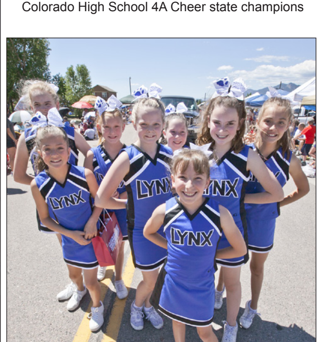
Monument Academy Lynx cheerleaders